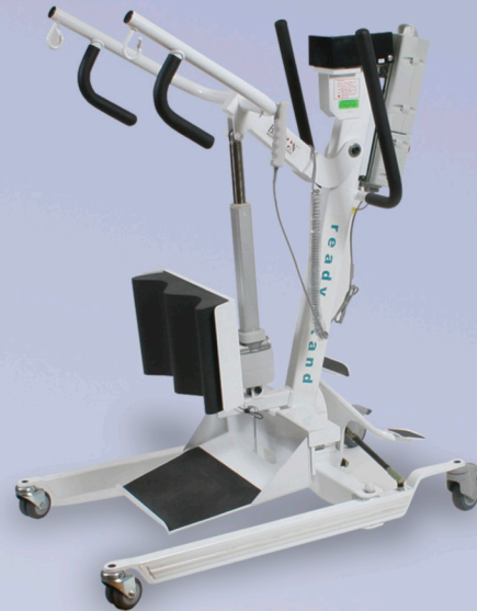
Sit-to-Stand Lift (500 lb. capacity)