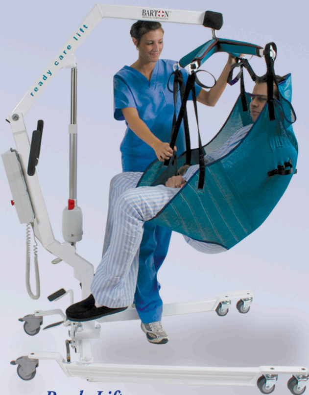
Ready Lift (700 lb. capacity)