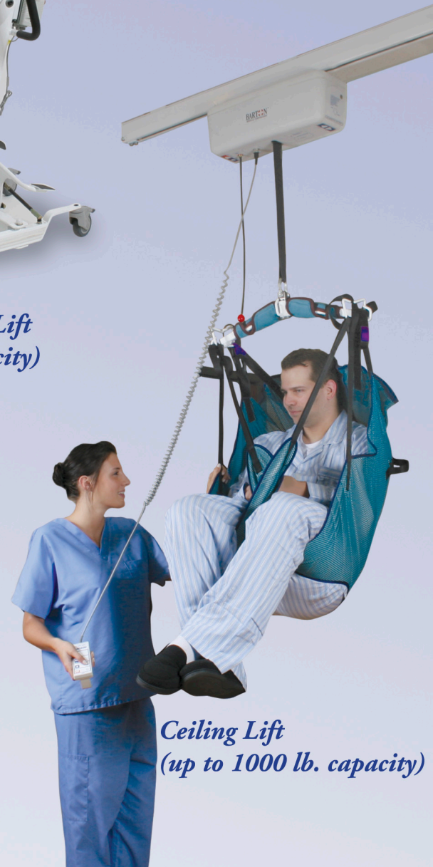
Ceiling Lift (up to 1000 lb. capacity)

BARTON ™ MEDICAL CORPORATION www.bartonmedical.com